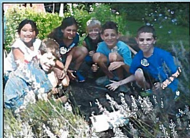
Tending to the kitchen herb garden on the historic Kissam property.

Time Travel takes on a whole new meaning! A unique summer camp designed to bring history to life!